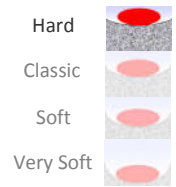
Compression deflection: load & unload acc to ISO 8301 (1)